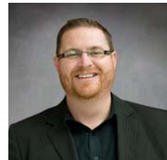
Graham Clarke Baptist Church Clergy Representative