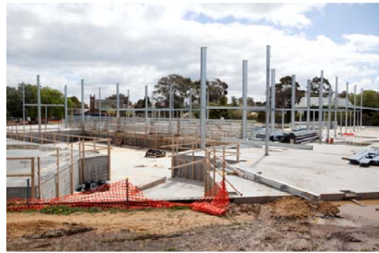
The multi-purpose hall at Bellarine Campus takes shape.